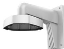
DS-1273ZJ-DM25 Wall mount