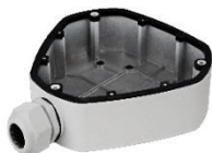
DS-1280ZJ-DM25 Junction box