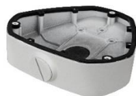
DS-1281ZJ-DM25 Inclined ceiling mount